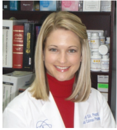
Written by Alexi Gill, Pharm.D.

When it comes to cholesterol-lowering agents called statins (including Lipitor, Crestor, Mevacor, Pravachol, Zocor, and Lescol) there are several side-effects that can be a nuisance. While these medications are generally well-tolerated, they can cause leg cramps, muscle fatigue and brain foginess.